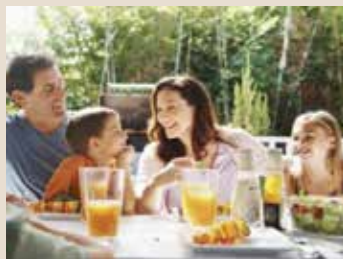
Family Food Enthusiasts